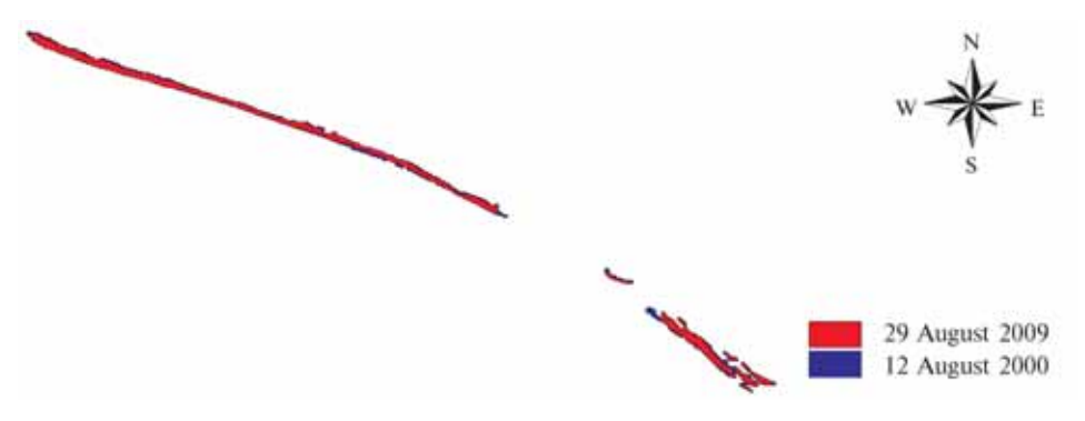
Fig. 3. Comparison of the vector layers of 2000 and 2009: changes of the Yarki sandbar

software OziExplorer, 2 way points in the widest site of the left part of the island were compared on the 1994 image. The coordinates of points 1 and 2 were saved in the wpt-file of the waypoints; the distance between these points was 243,7 m. Then, the 2009 image was loaded and it was overlaid with the waypoints from the wpt-file (Fig. 4). It can be seen, that the distance between the sandbar edges decreased. One more waypoint was added (Nº 3) at the boundary of the sandbar in 2009. The distance between