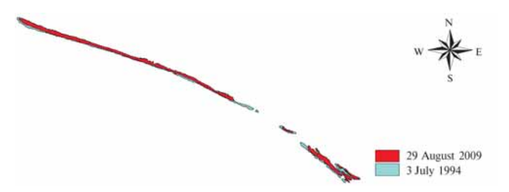
Fig. 2. Comparison of the vector layers of 1994 and 2009: changes of the Yarki sandbar

In order to measure the width of the sandbar Yarki digitally using the GPS mapping